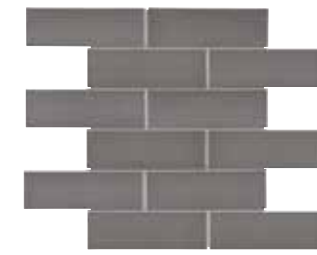
2 x 6 in / 5 x 15 cm Brick Mosaic Glossy 6001-0021-0