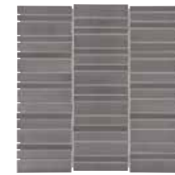
Random Stacked Mosaic Glossy 6001-0024-0