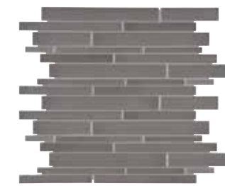
Random Strip Mosaic Glossy 6001-0025-0