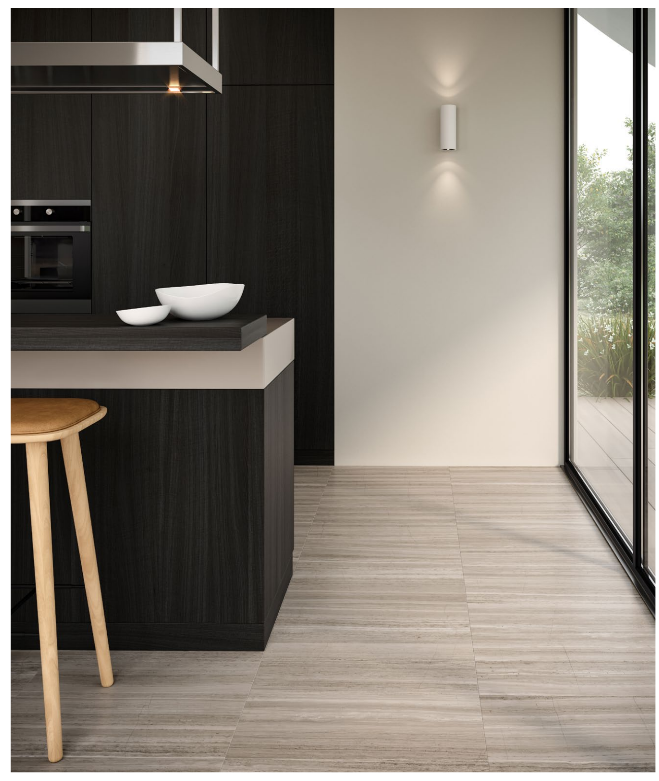
12 x 24 in / 30.5 x 61 cm Strada Mist Honed Limestone Tile