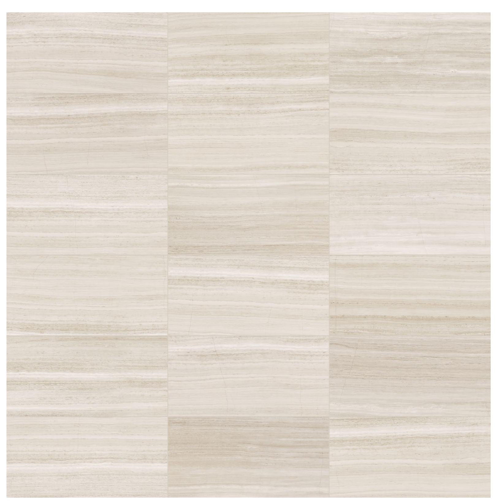
18 x 36 in / 45.7 x 91.4 cm image variations

The inherent beauty of natural stone products is expressed through variations in color, texture, shading and veining.