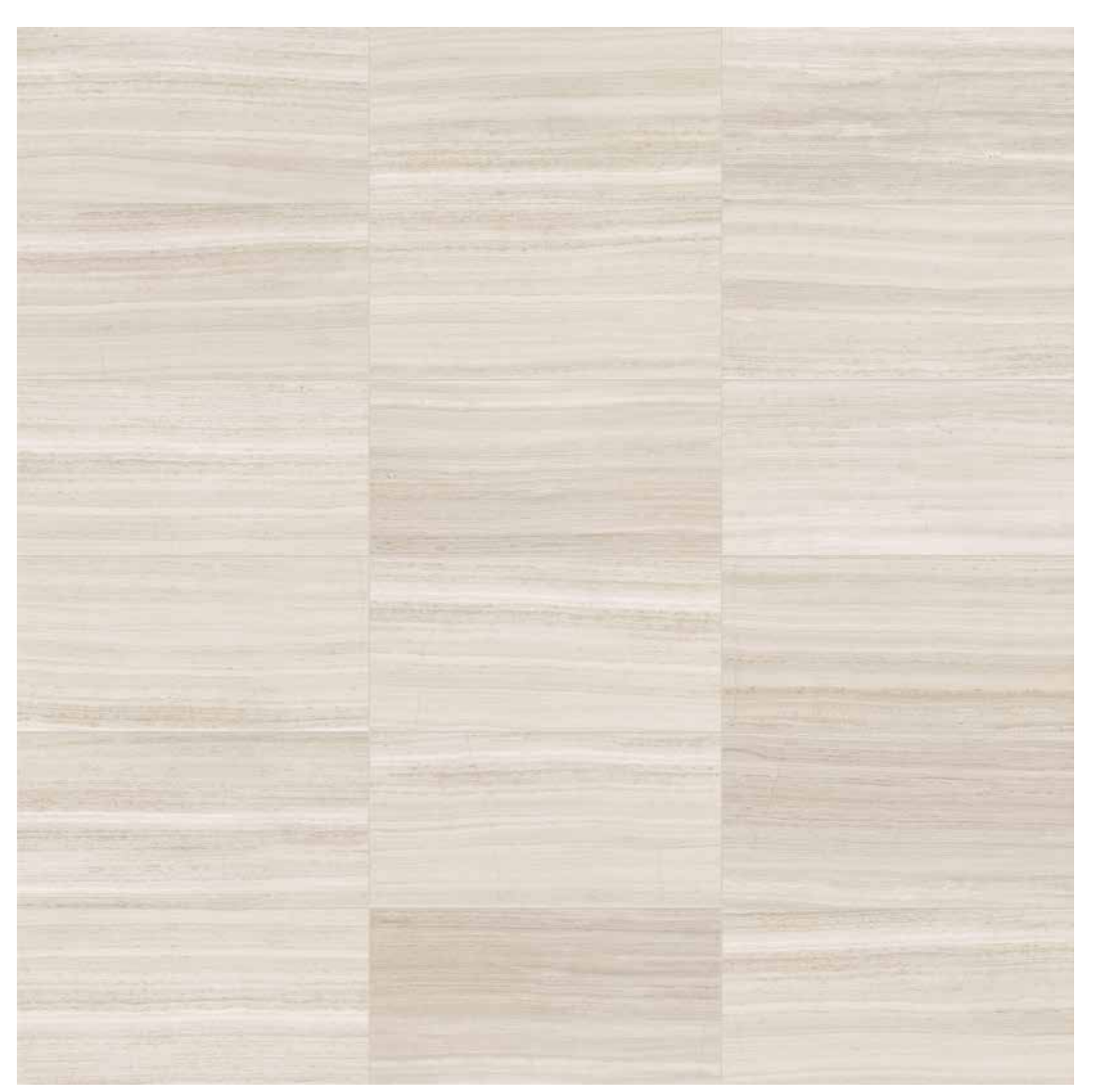
18 x 36 in / 45.7 x 91.4 cm image variations

The inherent beauty of natural stone products is expressed through variations in color, texture, shading and veining.