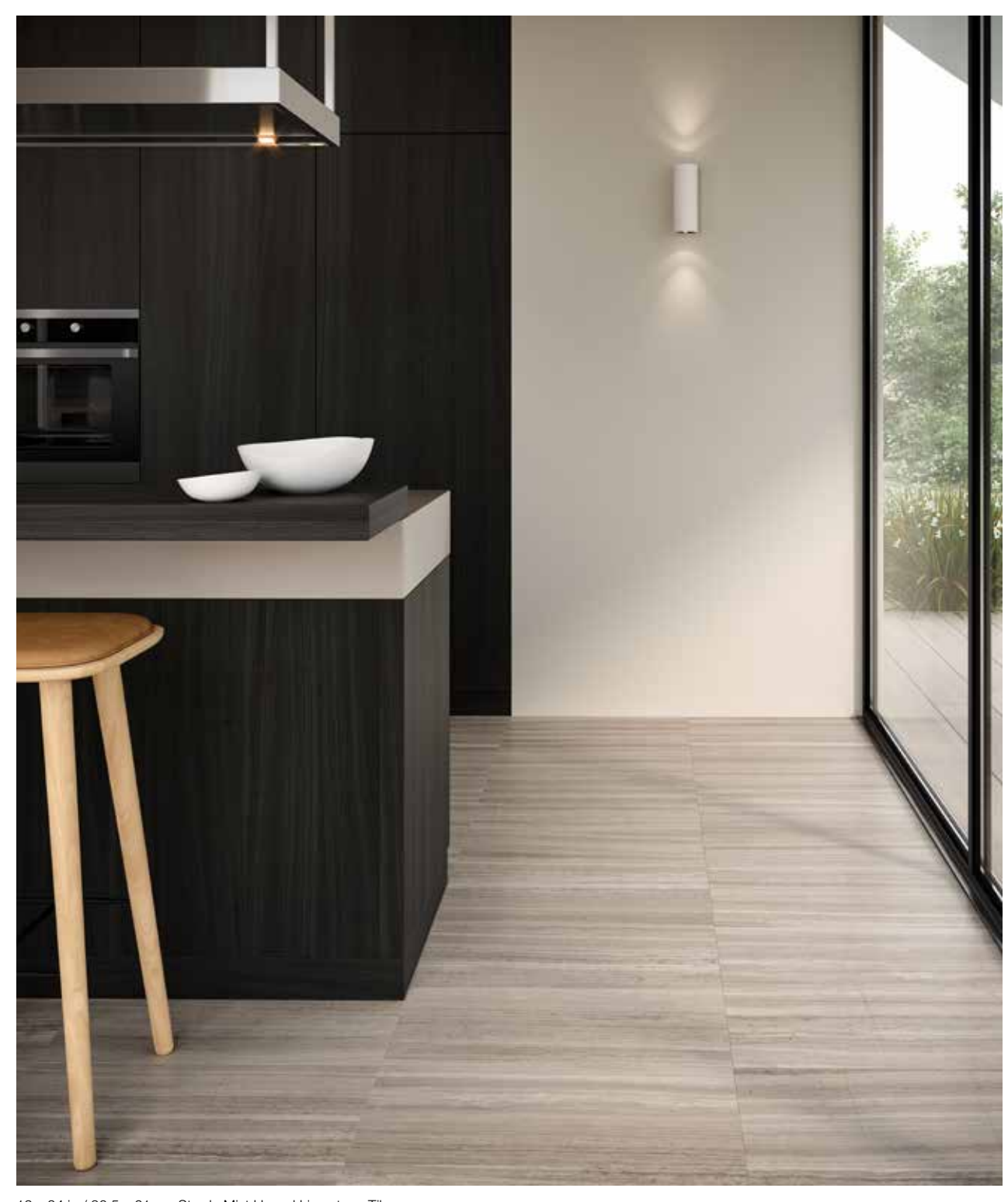
12 x 24 in / 30.5 x 61 cm Strada Mist Honed Limestone Tile