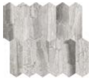
2 x 6 in / 4.9 x 15 cm Picket Mosaic Honed 5001-0326-0