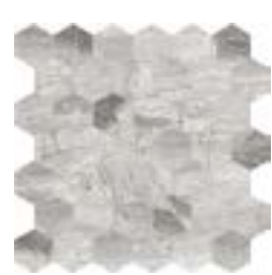
2 in / 4.9 cm Hexagon Mosaic Honed 5001-0324-0