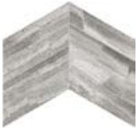
2 x 8.5 in / 5.3 x 21.3 cm Chevron Mosaic Honed 5001-0325-0