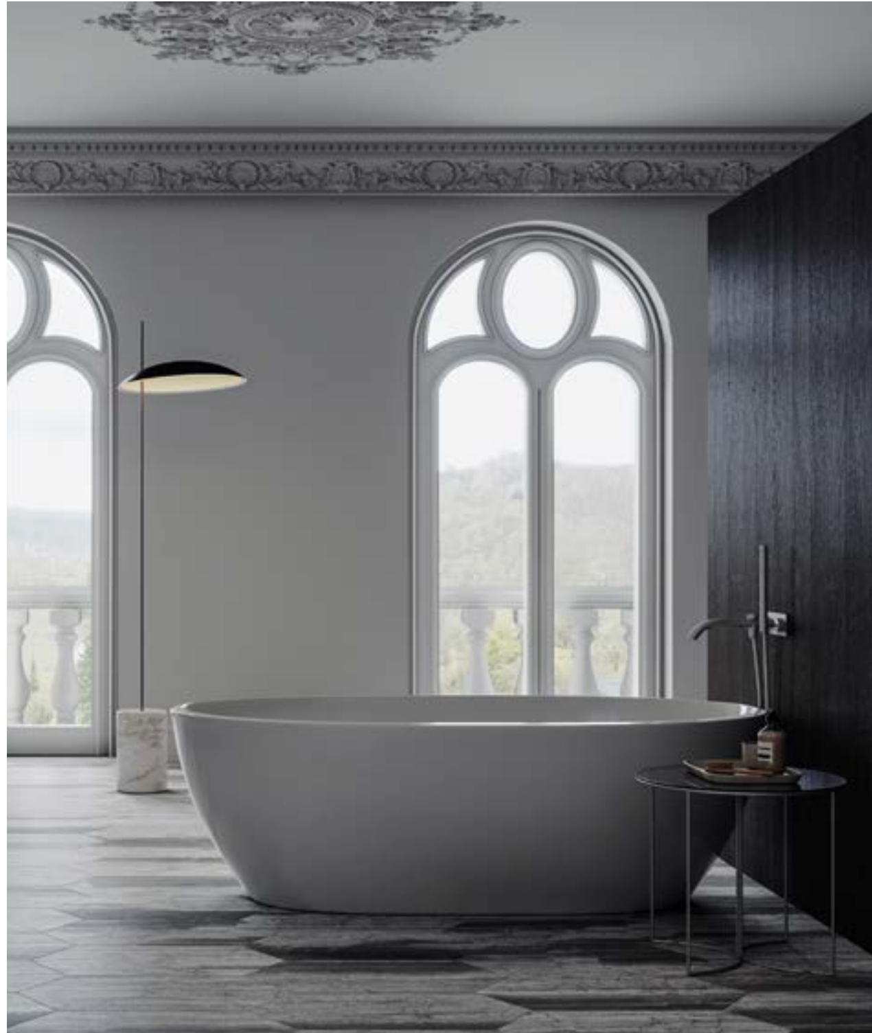
24 in / 60 cm Volcana Notte Picket Honed Marble Tile