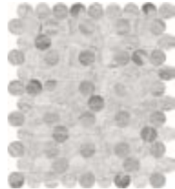
1.25 in / 3 cm Penny Round Mosaic Honed 5001-0327-0