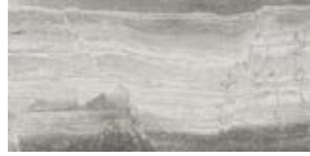
12 x 24 in / 30.5 x 61 cm Honed 5000-0425-0