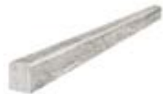
1/2 x 12 in / 1.3 x 30.5 cm Deco-Bar Honed 5002-0119-0