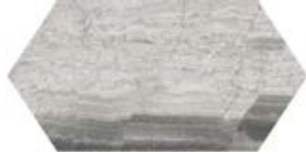
24 in / 60 cm Picket Honed 5000-0428-0