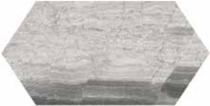
24 in / 60 cm Picket Honed 5000-0428-0