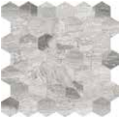
2 in / 4.9 cm Hexagon Mosaic Honed 5001-0324-0