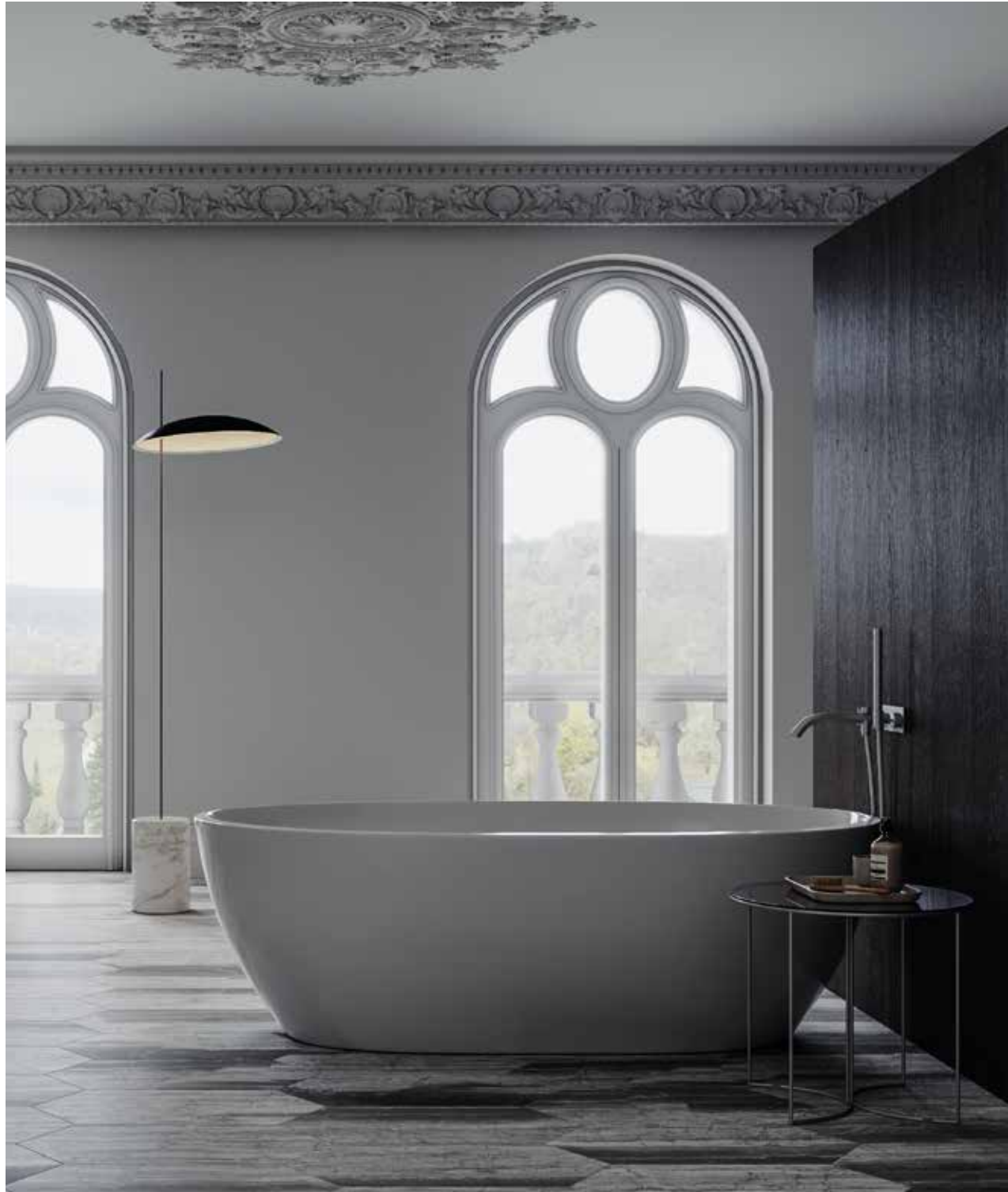
24 in / 60 cm Volcana Notte Picket Honed Marble Tile