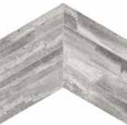
2 x 8.5 in / 5.3 x 21.3 cm Chevron Mosaic Honed 5001-0325-0