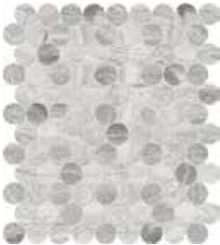
1.25 in / 3 cm Penny Round Mosaic Honed 5001-0327-0