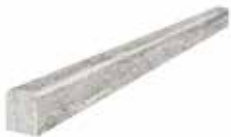
1/2 x 12 in / 1.3 x 30.5 cm Deco-Bar Honed 5002-0119-0

The inherent beauty of natural stone products is expressed through variations in color, texture, shading and veining.