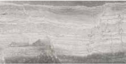
12 x 24 in / 30.5 x 61 cm Honed 5000-0425-0