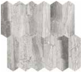
2 x 6 in / 4.9 x 15 cm Picket Mosaic Honed 5001-0326-0