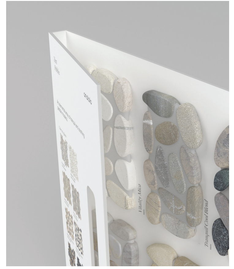
A&D Board Outside