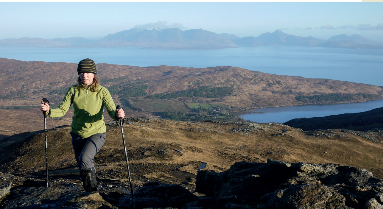
Climbing to the Bealach Bairc-mheall above Kinloch with the Skye Cuillin in the background

Walk a short distance north of Kinloch Castle to the junction by the bridge that leads to the community hall. Turn left here and continue for 150 metres before turning left at a metal gate. Follow the track past the old castle garden walls to the generator and continue along the Allt Slugan to the edge of the woodland before emerging onto rising open ground. (The path is distinct and easy to follow as it climbs beside the river.) Cross a couple of burns flowing into the river along the way, go through a gateway in an old deer fence and pass a small sluice dam before reaching the Coire Dubh at around 270m. Continue along the level path next to the Allt Slugan, soon arriving at a dilapidated stone dam – where the path marked on the OS Explorer map runs out. Cross the river here: 180m above the corrie to the southwest is the low point of the Bealach Bairc-mheall (466m) between Barkeval and Hallival. The path running directly up to the bealach isn't obvious at first, but it keeps to the left of the burn tumbling down into the corrie.