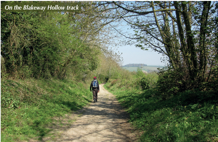
On the Blakeway Hollow track

In spring the view may be coloured by the vivid yellows of oil-seed rape. The path at this time will be decorated by wild violas, wood anemones, primroses, bluebells and wild garlic.