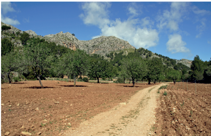
Almond groves in the Comellar de ses Sínies beyond Galatzó

Start at a crossroads at Plaça de Bernado Calvet in es Capdellà , around 130m (425ft). Follow Carrer de Galatzó, which is signposted for the Finca Pública Galatzó. A mapboard and signpost are passed at a junction with Camí del Graner del Delme. The road later becomes a track passing almond groves, olive groves and small farms, reaching a gateway on a gentle, wooded gap beside Puig Matós .