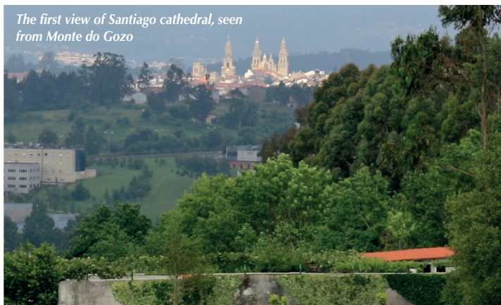
The first view of Santiago cathedral, seen from Monte do Gozo

The new motorway under construction when this guide was being written will greatly reduce traffic on the N-547.