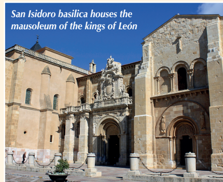
San Isidoro basilica houses the mausoleum of the kings of León

During the Roman occupation, León (pop 126,000) was the military capital of Spain and home city of the VII legion for almost 350 years. After the Romans left (AD476) the city went into decline and was captured by the Moors in AD712. Although reconquered in AD754, its position near the