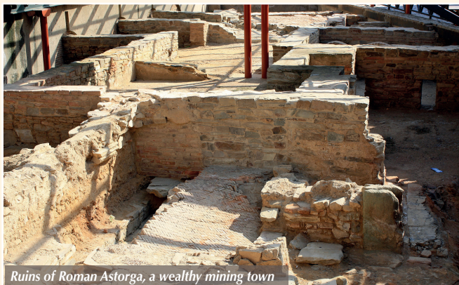
Ruins of Roman Astorga, a wealthy mining town

Astorga (pop 11,200), known to the Romans as Asturica Augusta, grew prosperous due to its position near to Roman gold mines. The city had paved streets, some covered with porticos, while a system of canals brought fresh water down from the mountains and underground sewers took the waste away. Part of the walls that surrounded the Roman city still stand and ongoing excavations are uncovering other Roman buildings and artefacts including baths, sewers and mosaic floors. All this ended with the collapse of the Roman Empire and similar levels of urban development did not reappear for over 1000 years.