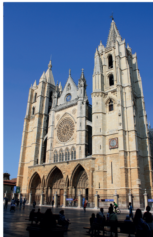
León cathedral is the leading example of French Gothic style in Spain

before Parque Santa Anna R, turn R into pedestrianised Calle Santa Anna. Pass yellow Santa Anna church L and fork R on one-way system. Cycle through Plaza del Riaño, passing through bollards uphill on cobbles, then turn R (Calle de la Santa Cruz) and follow this bearing L into Plaza Mayor. Continue ahead along L side of square into Calle Mariano Domínguez Berrueta and pass seminary and Episcopal's palace R to reach Plaza de Regla in front of cathedral in León (54.5km, 840m) (accommodation, albergue, youth hostel, refreshments, tourist office, cycle shop, station).