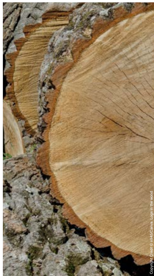
Logs in the wood

The ongoing due diligence obligation would also support more responsible financial practices for contractual financial services, for example when assisting clients with bond underwriting or sales, as was the case for Santander’s support to Minerva, or when providing loans. For instance, the requirement to conduct due diligence continuously could encourage banks and other financial institutions to exert their influence over clients with sustainability-oriented clauses in contracts, and monitor if and how the clients fulfil plausible conditionalities throughout the service provision period.