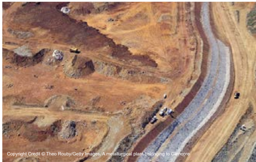
A metallurgical plant belonging to Glencore

Inconsistently, many investors of Glencore are frequently communicating about their commitment to sustainable investments. For example, BPCE as the biggest European investor in Glencore has, in its 2022 climate report, emphasised its pledge to a net-zero trajectory in financing and investment 19 . On the other hand, a few investors, such as Allianz, have used their shareholder rights to call for Glencore to be more transparent on climate issues 20 .