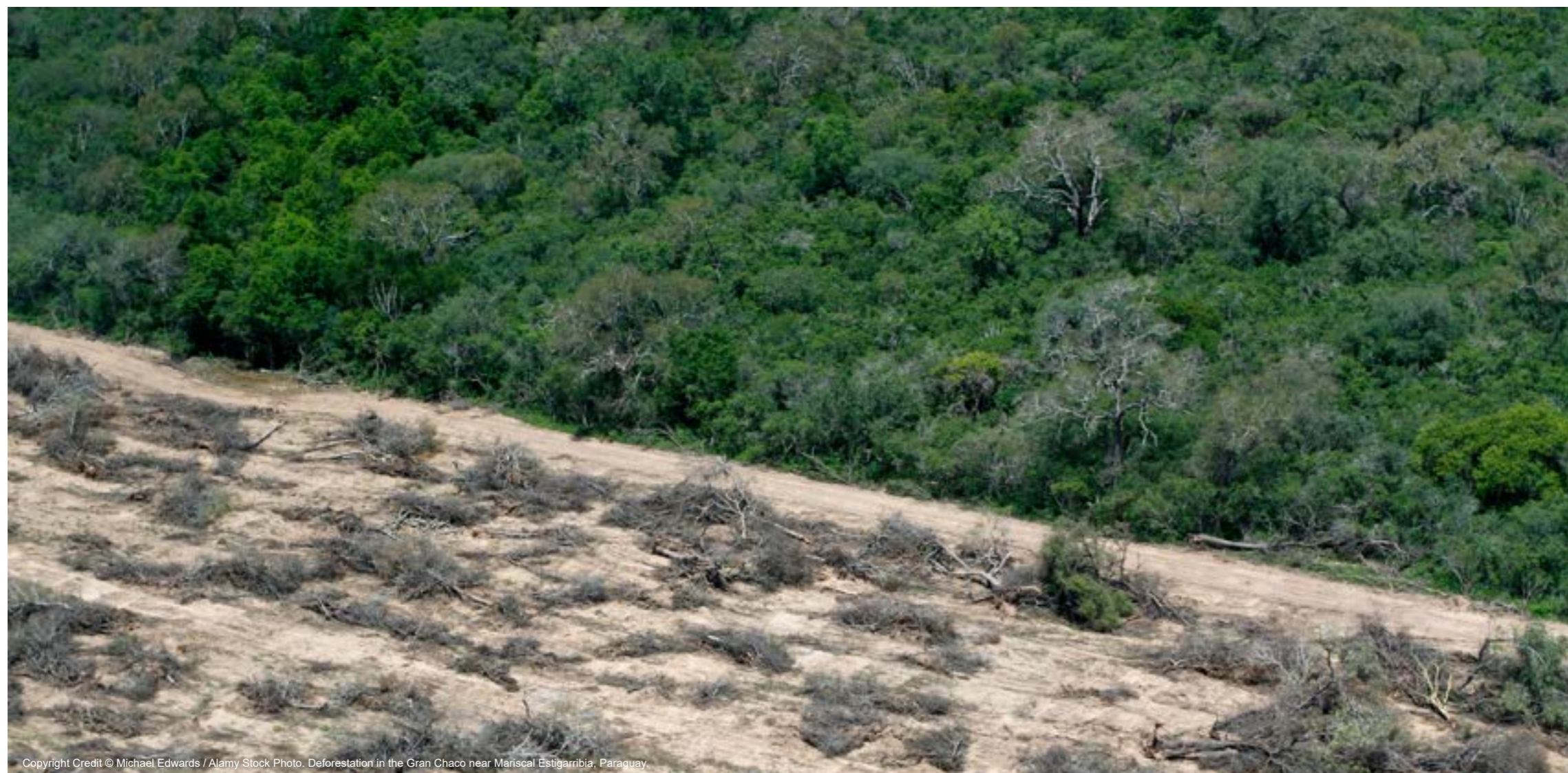
Deforestation in the Gran Chaco near Mariscal Estigarribia, Paraguay.