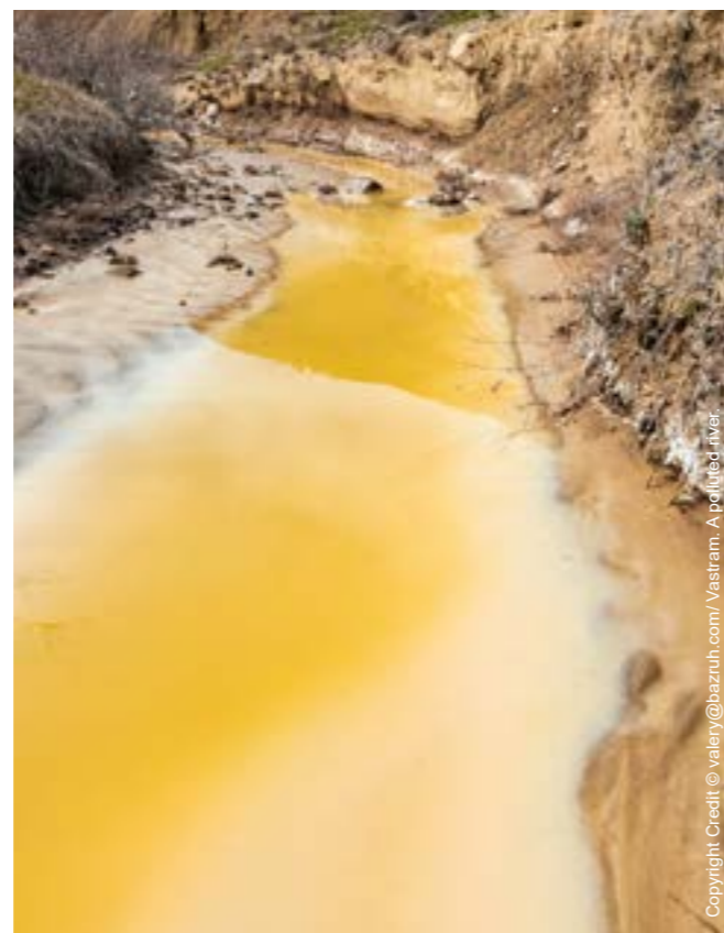
A polluted river.

climate report for 2022, and in favour of a request for Glencore to explain how its thermal coal production is compatible with the climate goals and what financial risks it entails 21 . To encourage stronger support for sustainability-oriented votes, the Directive could promote that not just selected progressive actors, but most institutional investors in the EU that have invested in Glencore and other more irresponsible firms, support AGM resolutions benefitting investors and the planet alike.