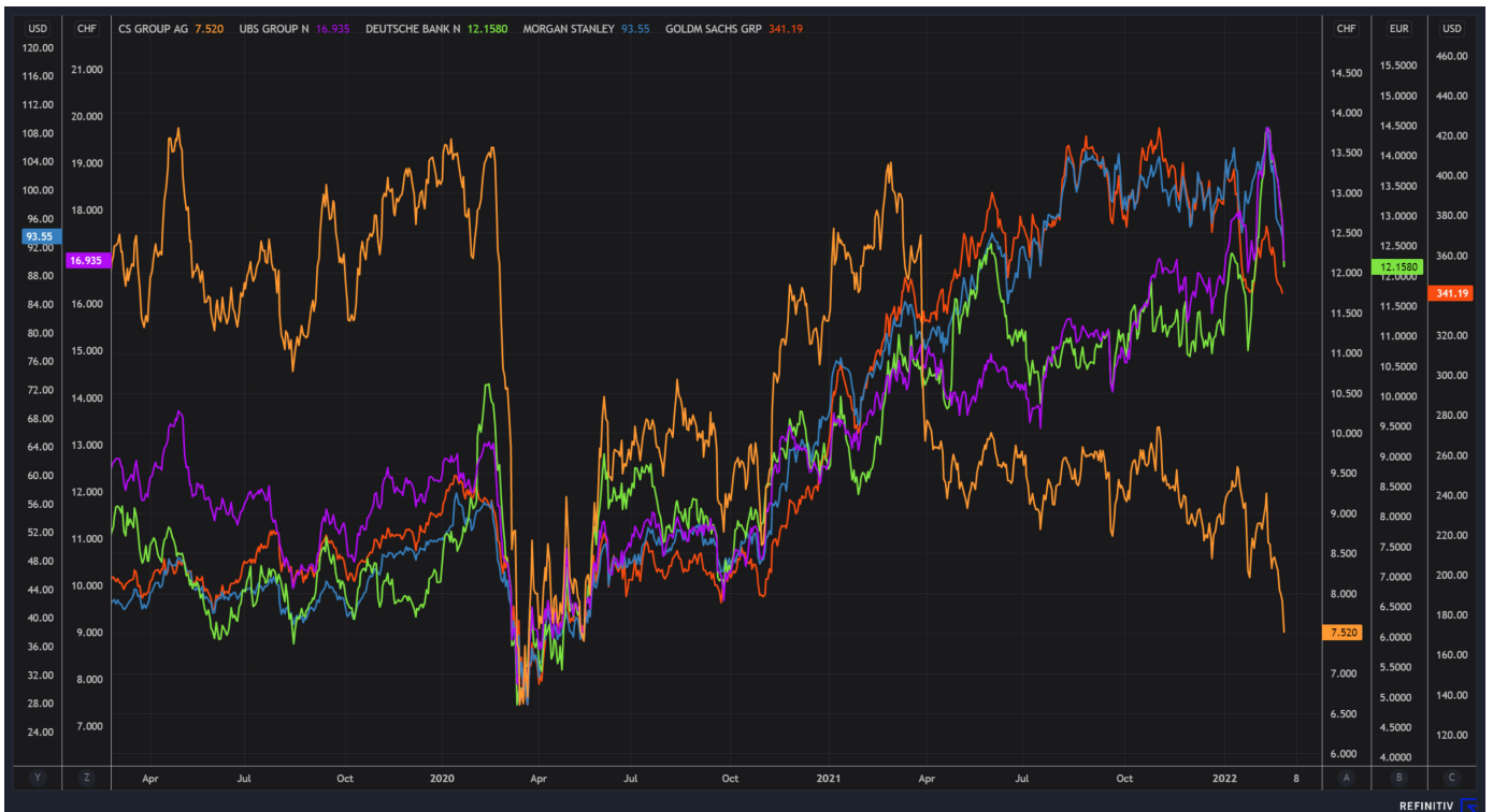
Figure 1: Credit Suisse's share price has plummeted in the past 2.5 years

Values reported as of 24 February 2022 at 9:30am GMT. All values are shown in stock exchange's local currencies (Credit Suisse and UBS: CHF; Deutsche Bank: EUR; Morgan Stanley and Goldman Sachs: USD)