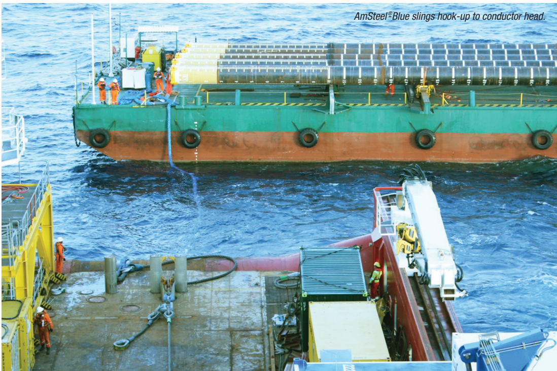
AmSteel®-Blue slings hook-up to conductor head.

Samson AmSteel®-Blue makes unique deepwater installation possible