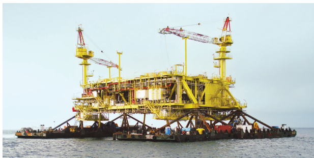
PHOTO 4: The topsides for the Kikeh Spar resting on two barges in a catamaran configuration.

SAMSON CORPORATE HEADQUARTERS 2090 Thornton Street, Ferndale, Washington 98248 USA Tel +1.360.384.4669 | Fax +1.360.384.0572