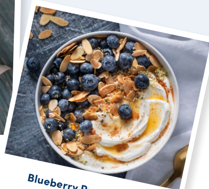
Blueberry Protein Bowl