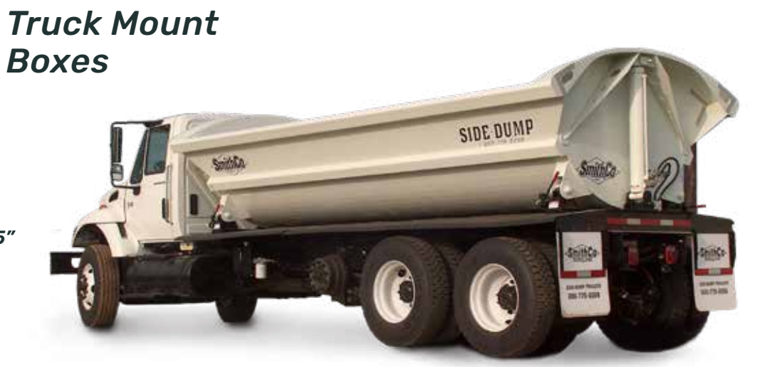
Easier transport Fully functional side dump Mounts to truck or tractor chassis