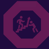
Supportive of Others