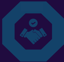
Open to Change

Our values underpin everything we do, including our recruitment, performance and promotion processes. We live by our values which define how we conduct ourselves and our business.