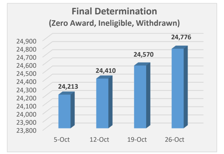
Invited 44,763 Homeowners to complete Applications.