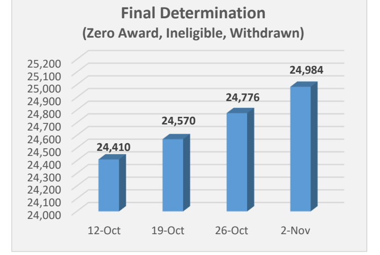
Invited 45,333 Homeowners to complete Applications.