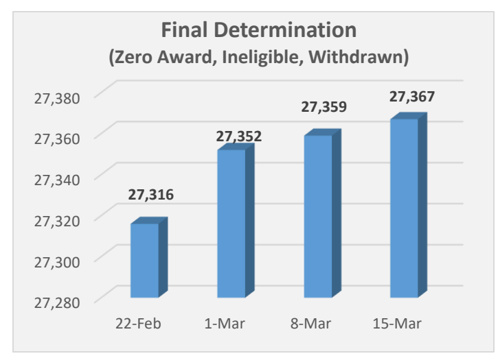
Invited 45,871 Homeowners to complete Applications.