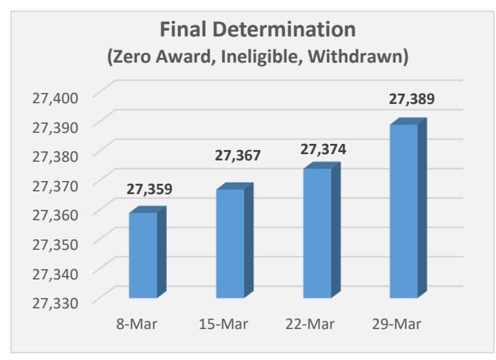
Invited 45,872 Homeowners to complete Applications.