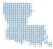
Appendix B Table 13: FEMA Major/Severe, Submitted Surveys and Completed Applications by Parish