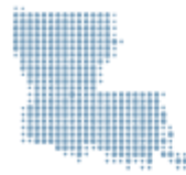
Appendix C Table 14: Grant Awards by Parish