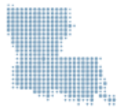
Appendix B Table 13: FEMA Major/Severe, Submitted Surveys and Completed Applications by Parish