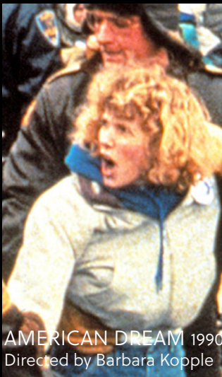
AMERICAN DREAM 1990 Directed by Barbara Kopple