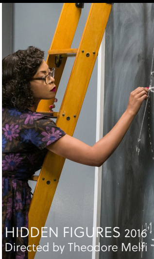
HIDDEN FIGURES 2016 Directed by Theodore Melfi