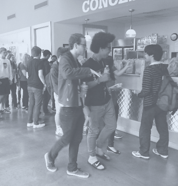
Students collect lunch on their way into the theater for SMALL CHANGE .