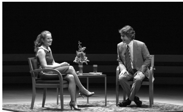
Debra Winger and Alexander Payne.