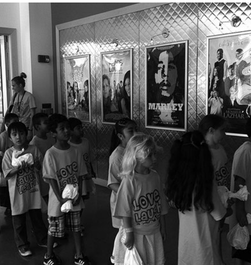
Close to 200 students from Jackson Elementary visited the theater for a special daytime screening of CHARLOTTE'S WEB.

"It was interesting to see the difference between French films and American ones. SMALL CHANGE was certainly very funny, but the director's sense of humor was definitely darker than the average American director's. It was also cool to have the discussion at the end of the movie so we could compare our thoughts and perceptions of the film to those of other students. I had gone to the movies at Film Streams before and enjoyed those. This time, however, was particularly good because we got to interact with other students. I would really enjoy going to another movie there."