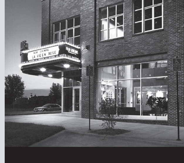
Ruth Sokolof Theater 1340 Mike Fahey Street

Buy tickets at the box office (open 30 min. before the day's first showtime) or online at filmstreams.org . Unless otherwise noted, tickets are $9 general, $7 for seniors, students, teachers, military, and those arriving by bike, and $4.50 for Members.