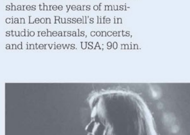
A POEM IS A NAKED PERSON

Join director Les Blank as he shares three years of musician Leon Russell's life in studio rehearsals, concerts, and interviews. USA; 90 min.