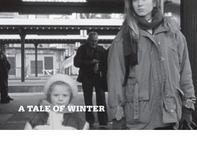
A TALE OF WINTER

See reverse side for more information and dates.