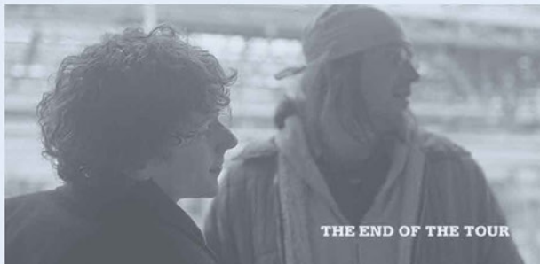
THE END OF THE TOUR

Locked away from society in a New York apartment, the Angulo brothers obsess over their favorite films in this one-of-a-kind documentary. USA; 84 min.