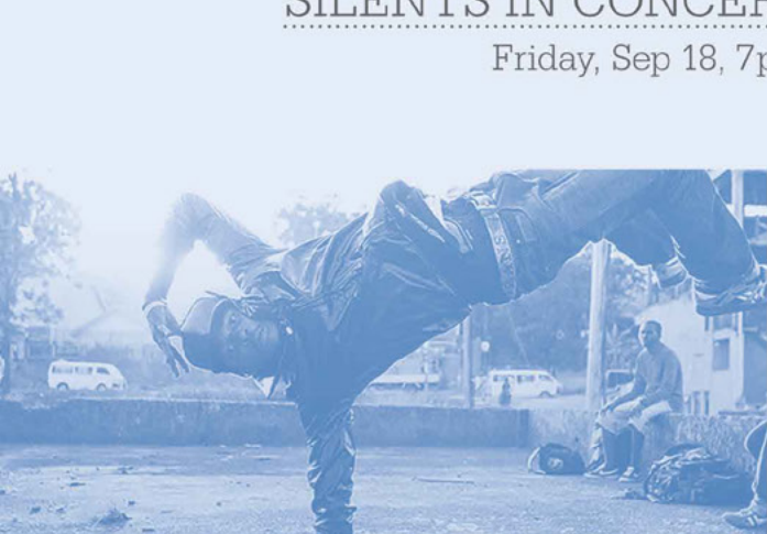
SHAKE THE DUST