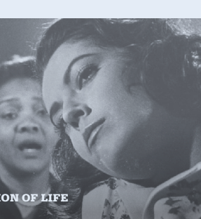
IMITATION OF LIFE

With post-show Screen Chat, Feb 26 at 3pm.