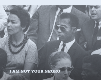
I AM NOT YOUR NEGRO

Repetitiously depicting the everyday until the cumulative effect feels profound, this minimalist ode to life stars Adam Driver as a New Jersey bus driver. France/Germany/USA; 118 min.