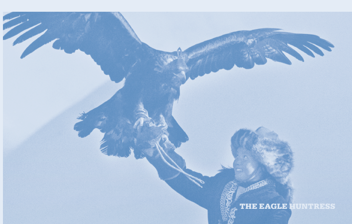
THE EAGLE HUNTRESS

Follows a 13-year-old girl as she trains to become the first female in twelve generations of her Kazakh family to be an eagle hunter. In Kazakh with English subtitles. UK/Mongolia/USA; 87 min.