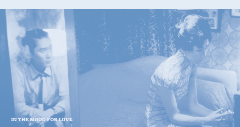
IN THE MOOD FOR LOVE