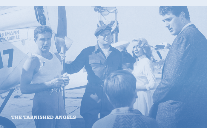
THE TARNISHED ANGELS