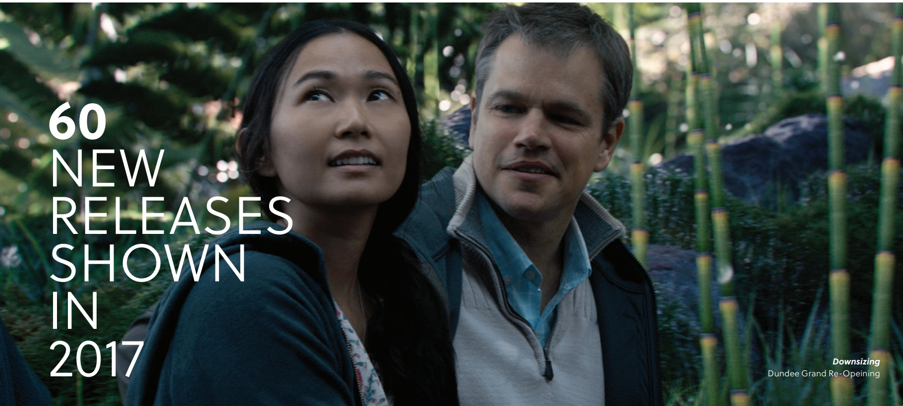
Downsizing Dundee Grand Re-Opening