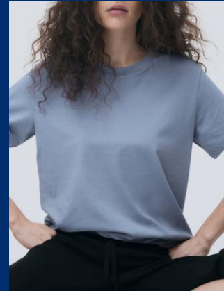
T-shirts / Tops

Recover™ fiber can be used for a broad array of applications, most notably apparel, accessories and home textiles.