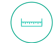
Anthropometric data collection and surveys