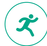
Dynamic / Athletic Posture Assessment