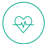
Vitals Sign Screening