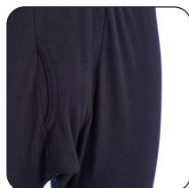
Easy access fly