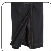
Flexi-Gusset Ankle Cuffs