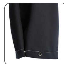
Popper Cuff Secure