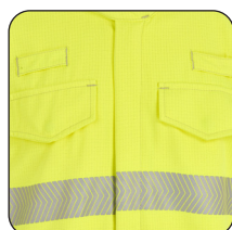
Double Breast Pockets & PAM Loops