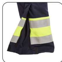
Flexi-Gusset Ankle Cuffs