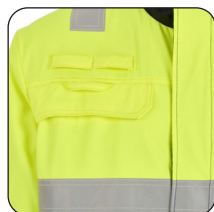
Double Breast Pockets & PAM Loops