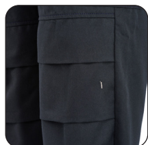
Articulated knee & kneepad pocket