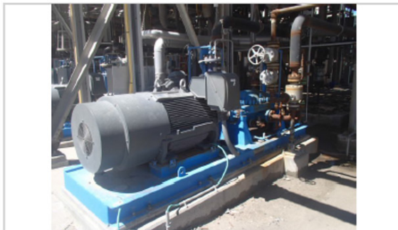
C1001020141 #2 Boiler Feed Water Pump (1-3)